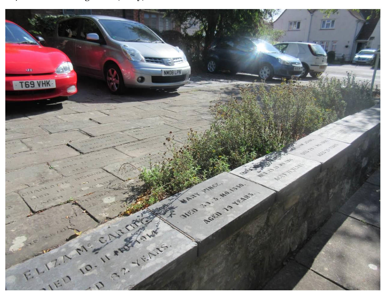
Figure 2: Relocated grave markers

There is no burial ground, but a large number of flat grave markers from Quakers Friars and the Central Meeting House site have been reset in the area of the current car park (figure 2). These stone and slate memorials include a number to members of well-known local Quaker families, eg Sturge and Gurney. The memorial to Joseph Storrs Fry II (1826-1913), head of the family chocolate firm, is here.