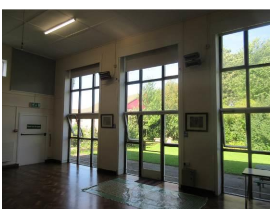
Statement of Significance

A purpose-built meeting house of the 1950s, of low evidential, historical and aesthetic value, but high communal value. Reset grave markers from Quakers Friars and the Central Meeting House site are of high evidential and historical value.